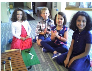
Lower Elementary enjoying their music lesson