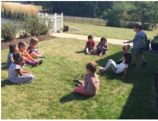
Green Room playing a game of Duck, Duck, Goose at recess