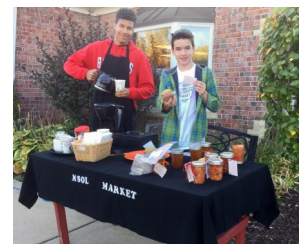
Adolescents running their MSOL Fresh Market during carpool.

1st-8th grade visits are scheduled for October 16th and will cover evacuation plans, safety trailer and a roundtable discussion with firefighters.