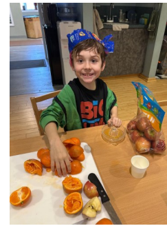
Snack prep and a fashion statement!

In order for your child to perform their best, please be sure he or she gets a good night's sleep and begins their day with a healthy breakfast! Parents who prefer for their children not to participate may opt out.