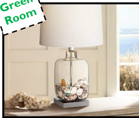
Nature Inspired Lamp