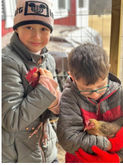
Chicken Checkers reporting for duty!

“I have a joke in my head. That’s why I’m always laughing!” -H.G., age 5