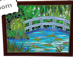
Stained Glass Window