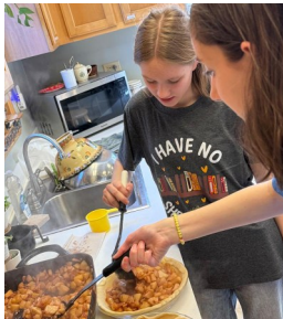
Adolescents making pie for Pi Day