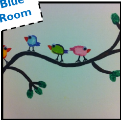
Finger Prints on Canvas