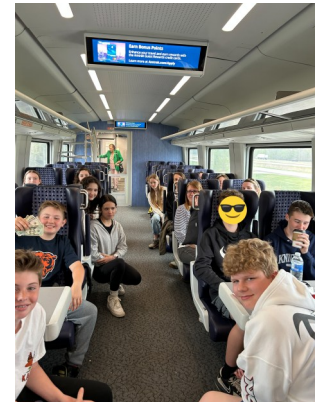
The Adolescent Class on the train to Springfield

The group’s itinerary included key landmarks such as the Illinois State Museum, where students explored exhibits on natural history, Native American cultures, and Illinois’ industrial development. They also visited the Illinois State Library, the Capitol Building, Lincoln’s Home and Museum, along with other sights that the students had been researching.