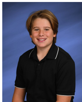
1st Place winner!

Each year, MSOL proudly participates in the Patriot's Pen contest sponsored by Lockport VFW Post 5788. The contest "encourages young minds to examine America's history, along with their own experiences in modern American society." VFW Post winners