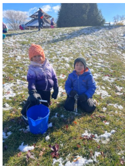
The first snow is always exciting!