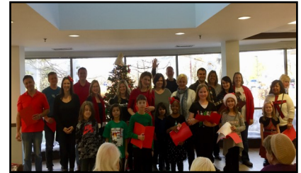
Lemont Nursing and Rehab Center 12450 Walker Road, Lemont December 11, 2025, 3:30 pm

"Did you know that bagel injuries are way more common than bear attacks?"