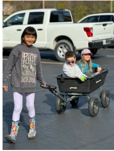
Upper Elementary students riding in style