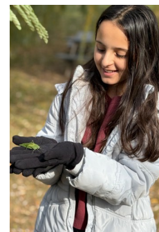
Making friends with a katydid