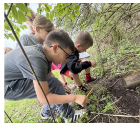
Zen Garden clean up