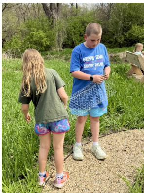
Planting willow saplings propagated in Environmental Ed class