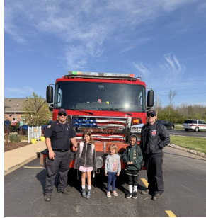
Ride to School in a Fire Truck!