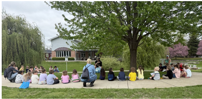
Primary students gather to sing "I Love the Earth" before an Earth Day scavenger hunt