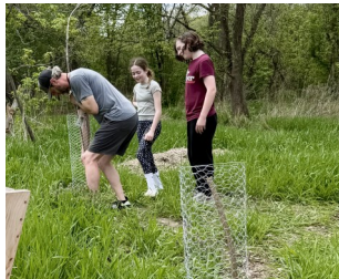
Plant identification scavenger hunt