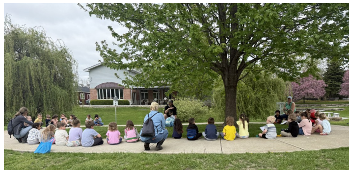
Primary students gather to sing "I Love the Earth" before an Earth Day scavenger hunt