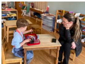
Parent-Student Evening in the Blue Room