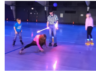
Limbo! Upper El & Adolescent students at Family Fun Zone on Valentine's Day

In order to perform their best, please be sure your child gets a good night's sleep and begins their day with a healthy breakfast.