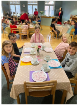
Lower Elementary students hosted their annual Friendship Tea on February 14th.