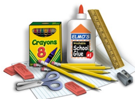
School Supply Lists are available on Transparent Classroom!

We are thrilled to announce our first fundraiser of the year. These beautiful mums come in multiple sizes and colors. Do not miss out on the chance to brighten your garden and support our community! Sales close on September 2, and delivery will be on September 11. Order now and help make a difference!