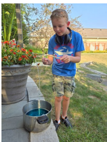
Unbreakable bubbles in After School Special, Ooey Goey Science