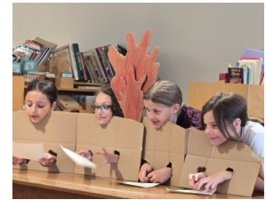
Upper El students showing creativity with their volcano presentations

“My brain is not braining!” -R.B., 7 th grade