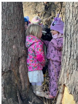
Bundled-up Nature Walks